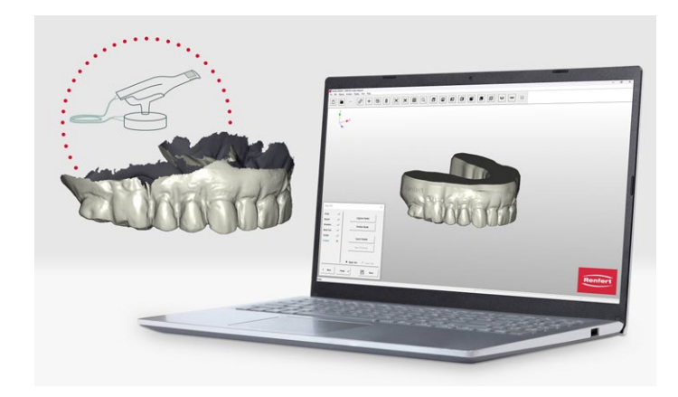
Quick and easy from open scan to closed model