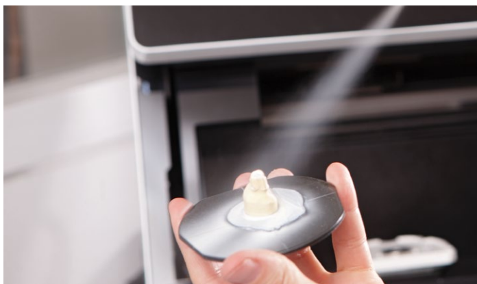
Homogenous layering or precise scanning results